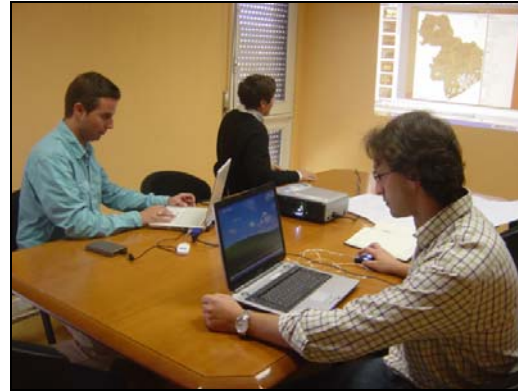
Identification of energy savings in municipal buildings: case-studies (Paulo Martins - AREAL)